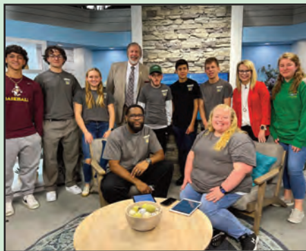
The Indian River High School unified basketball team was featured on WBOC's Delmarva Life on February 1.