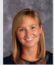
Elizabeth Edwards Long Neck Elementary School