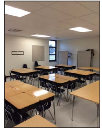
One of eight new classrooms at East Millsboro Elementary School.

The district will solicit construction bids for the Georgetown Elementary School/Georgetown Middle School project in March. Work is scheduled to begin in the