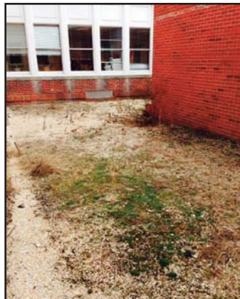
The courtyard to be refurbished at Millsboro Middle School.

The Millsboro Middle School building was closed for extensive interior renovations from 2006-2008. Prior to the renovation, the courtyard con-