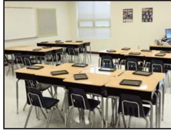
Students and teachers have moved into new classrooms at North Georgetown.

Work is complete at North Georgetown Elementary School, where teachers and students moved into eight new classrooms in early January. East Millsboro Elementary School began moving into its eight new classrooms in early February. Those rooms will be