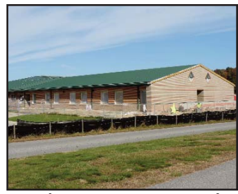
North Georgetown expansion project in early-November.

The district's other Blue Ribbon Award winners are Long Neck Elementary (2005 and 2011), East Millsboro Elementary (2008), North Georgetown Elementary (2006), Phillip C. Showell Elementary (2003) and Lord Baltimore Elementary (2001).