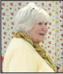
Local artist visits APELL program, Page 2