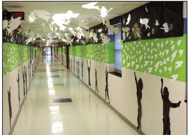
The art installation created by students at Southern Delaware School of the Arts. The work was dedicated to the victims of the Paris terrorist attacks.

The installation was officially dedicated during school's