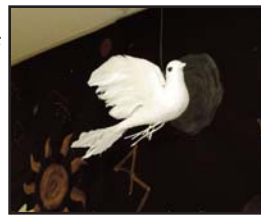
One of the many doves featured in the work.

It was the first art installation produced by SDSA students in five years. Students in the elementary grades assisted in its creation by making white doves out of construction paper.