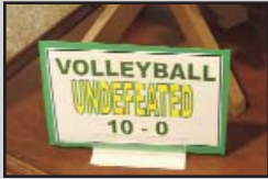
Successful fall sports seasons at SMS, Page 4