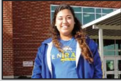
Student wins Horatio Alger Scholarship, Page 3