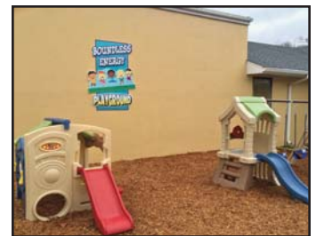
The new TOTS Boundless Energy playground at the G.W. Carver Center in Frankford.

• On Jan. 19, the district's Transitioning Our Toddlers to School (TOTS) program held a special dedication ceremony for its new Boundless Energy Playground at the G.W. Carver Center in Frankford. The new playground was funded through a generous $5,000 grant from the Carl M. Freeman FACES Foundation. The playground was installed in December and serves about 60 special needs preschool students.