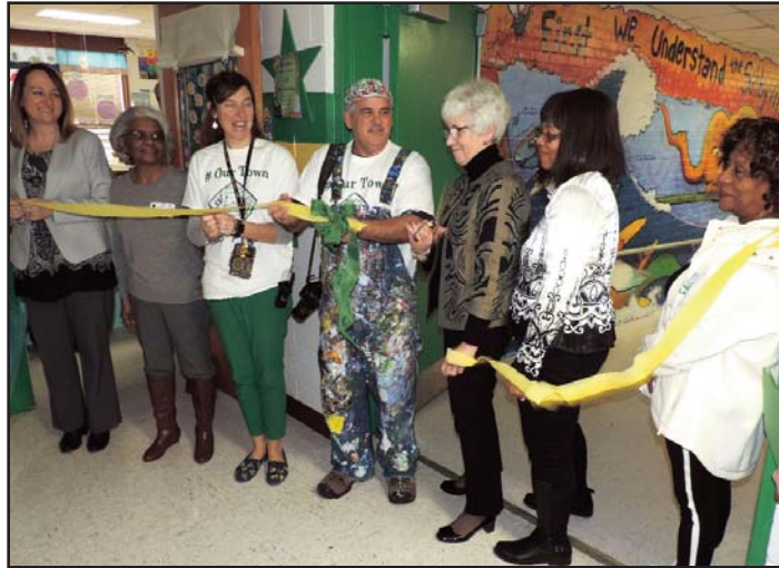
Officials cut the ribbon to officially unveil the new mural at PCS.