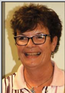
Delaware School Nurse of the Year, Page 2