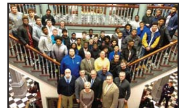
The team was honored at Legislative Hall in Dover in January.