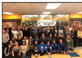
The Millsboro Middle School staff with its Recognition School banner.

At a special ceremony on Dec. 10 at Clayton Intermediate School, the Delaware Department of Education named Millsboro Middle and Long Neck, along with 13 other schools statewide, as 2018 Recognition Schools. Each school will receive an $8,000 award. There was also one School of Continued Excellence that was honored as a Recognition School last year and had