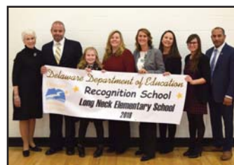
Long Neck representatives receive their banner at the ceremony on Dec. 10.

Recognition School awards were created by legislation passed by the Delaware General Assembly in 2009. The awards are given to schools whose students are performing