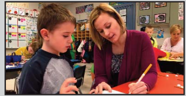
LB Teacher Wins Presidential Award, Page 3