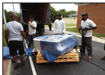
A moving crew delivers the piano to the school.