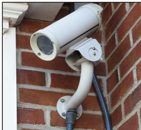
State grant funding will allow the district to purchase new entrance cameras and enhanced radios for staff (below).