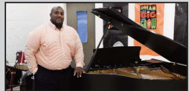
Piano Donated to Elementary School, Page 3