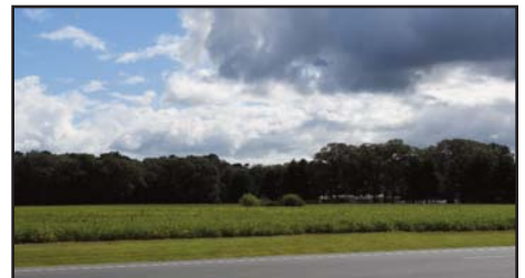
The new Howard T. Ennis School will be built on Patriots Way across from Sussex Central High School.