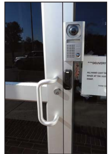
All school entrances are now equipped with intercoms, cameras and enhanced locks.

our security measures and making improvements where necessary. We are committed to our ongoing efforts to provide the safest possible learning environment for our students and staff."